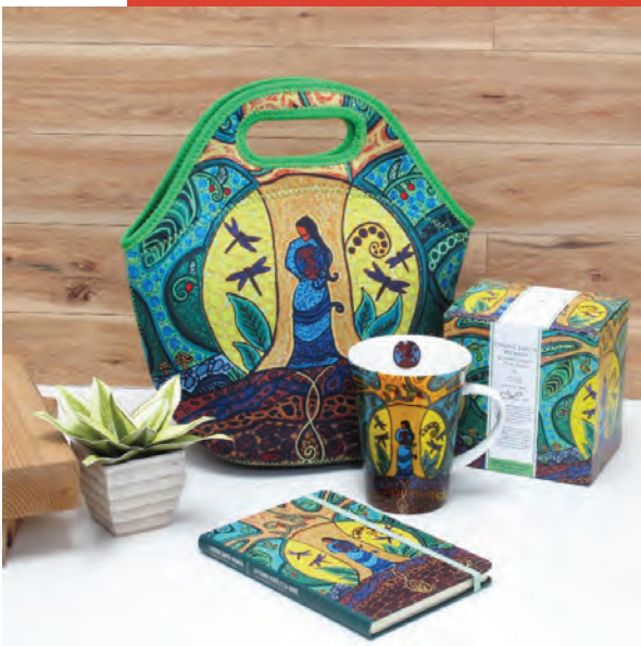
In January 2024, Arctic Beverages purchased Oscardo, a national distributor of products featuring designs by Indigenous artists.