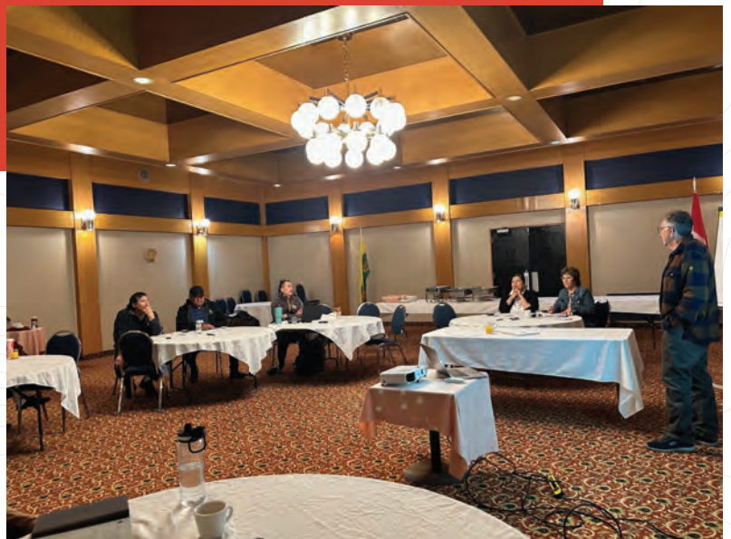
PADC strategic planning session, June 3, 2024.